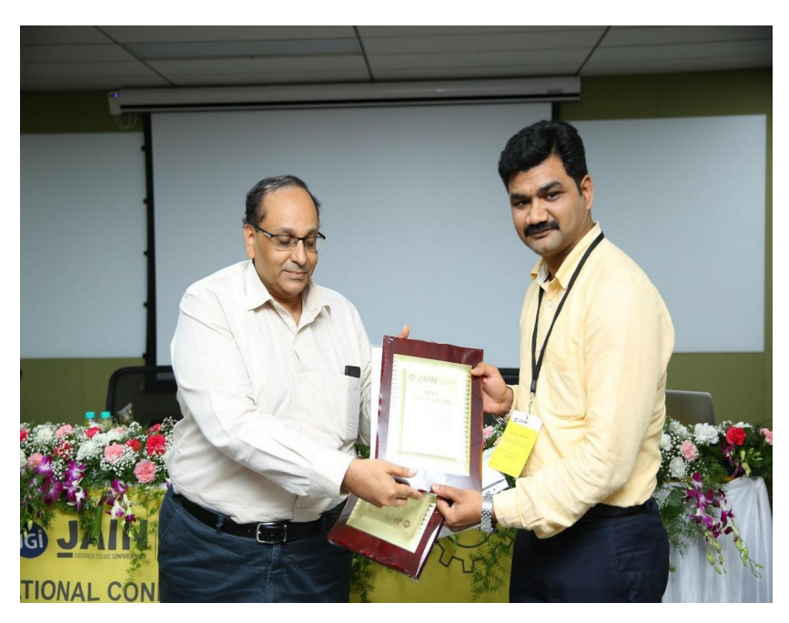
Figure 13: National Conference on "Revisiting Industry-Academia Collaboration: Exploring New Paradigms in Value Creation" on 24/08/2019-Best Paper award