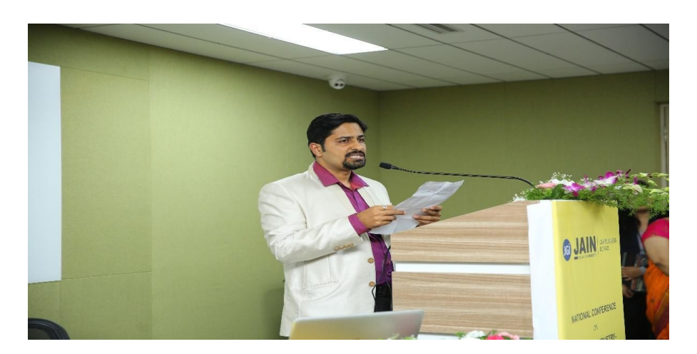
Figure 15: National Conference on "Revisiting Industry-Academia Collaboration: Exploring New Paradigms in Value Creation" on 24/08/2019-Vote of thanks