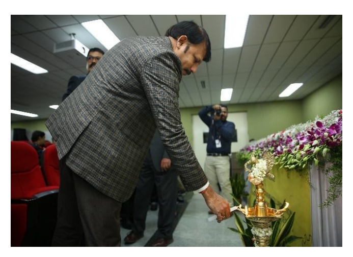
Figure 1: National Conference on "Revisiting Industry-Academia Collaboration: Exploring New Paradigms in Value Creation" on 24/08/2019-Inauguration