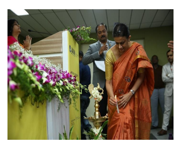
Figure 2: : National Conference on "Revisiting Industry-Academia Collaboration: Exploring New Paradigms in Value Creation" on 24/08/2019-Inauguration