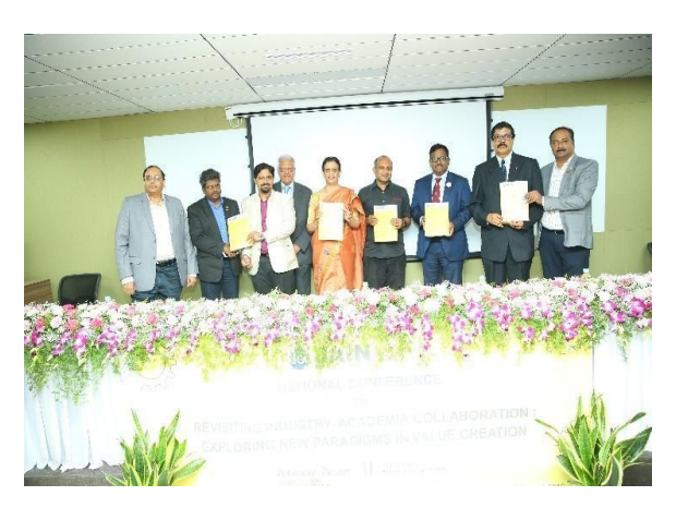
Figure 3: National Conference on "Revisiting Industry-Academia Collaboration: Exploring New Paradigms in Value Creation" on 24/08/2019-Inauguration