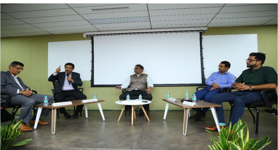
Figure 5: National Conference on "Revisiting Industry-Academia Collaboration: Exploring New Paradigms in Value Creation" on 24/08/2019-Panel discussion