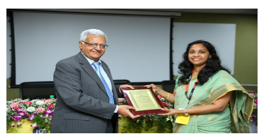
Figure 12: National Conference on "Revisiting Industry-Academia Collaboration: Exploring New Paradigms in Value Creation" on 24/08/2019-Best Paper award