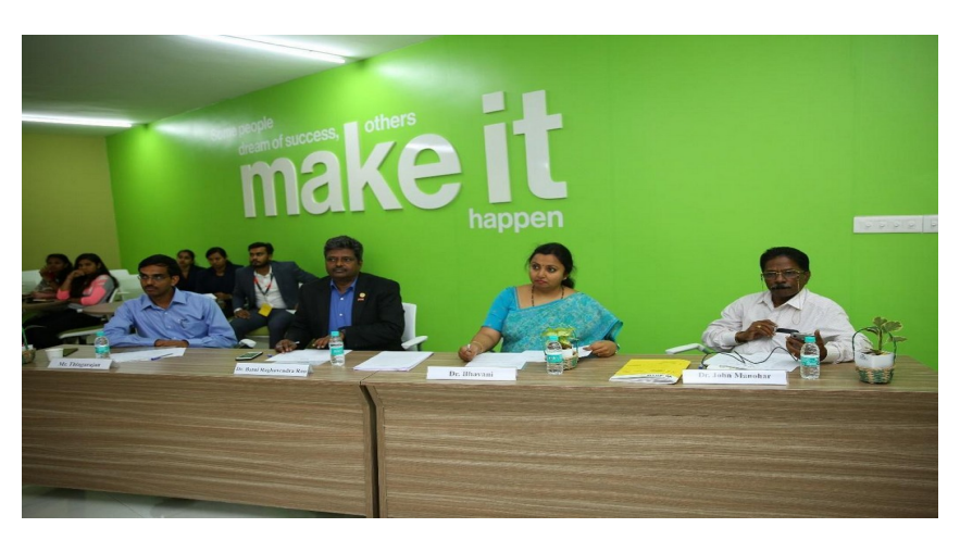
Figure 6: National Conference on "Revisiting Industry-Academia Collaboration: Exploring New Paradigms in Value Creation" on 24/08/2019-Track session